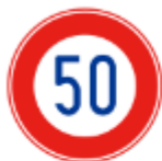
Max. speed (50km)