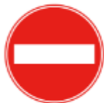
Closed to all vehicles