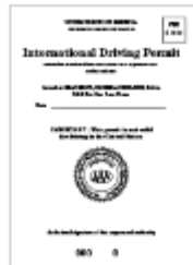
International Driving Permit

> List of the contracting countries of the Convention at Geneva 1949