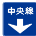
Center road line