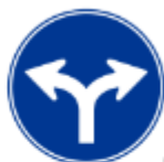
Only designated directions permitted