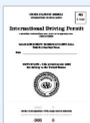
International driver's license

(Or an international driver's license and its Japanese translation if applicable.)