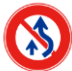
No passing on the right-hand portion of the road for overtaking